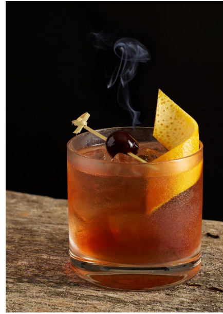
SMOKED CHERRY OLD FASHIONED