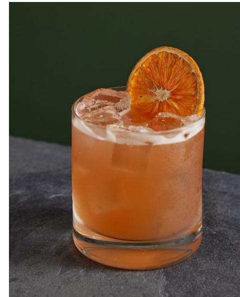
BLOOD ORANGE MARGARITA