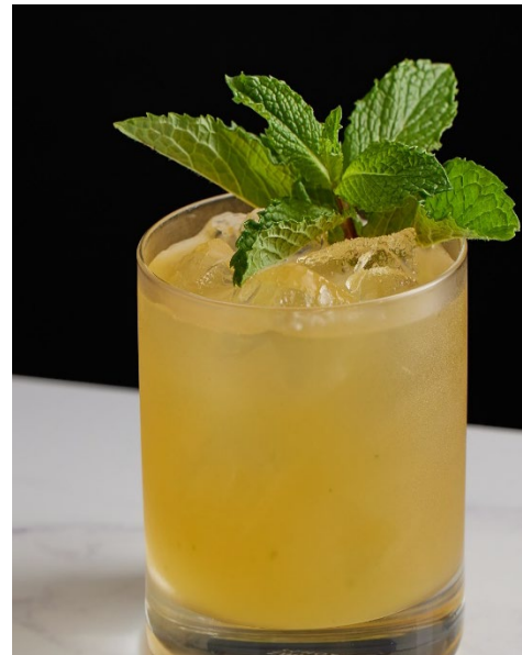
WHISKEY PEACH SMASH